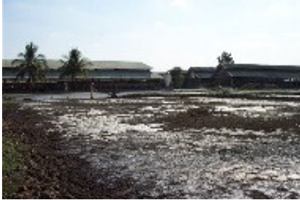
Figure 1 Lagoon, The Local Common Practice

The Project proposes an alternative manure waste management system to recover methane gas emissions as an alternative to the current open lagoon systems. Wastewater treated in these lagoons is often at an ambient temperature of around 35°C, and under anaerobic conditions. The result of this is that biogas methane is emitted continuously from lagoons as can be seen in this typical farm lagoon system image.