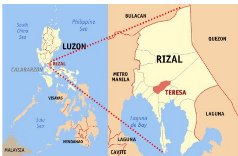
Figure 3 Location Maps 2